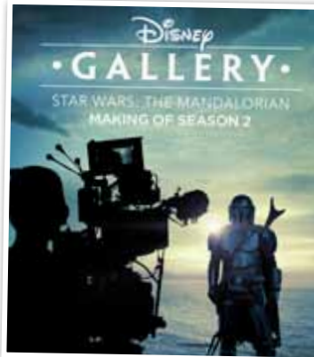
FOR FANS: The Mandalorian special

this hour-long behind-the-scenes special tells you everything you need to know - and possibly quite a bit more - about the creation of the award-winning Star Wars spin-off's second season.